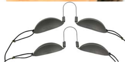
Durette II small and regular Treated inside to diffuse laser light