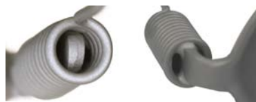
Features a strong assembly