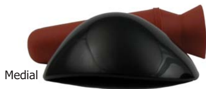
With suction cup